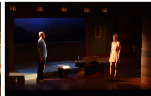
THE HOPPER COLLECTION The Magic Theatre, San Francisco